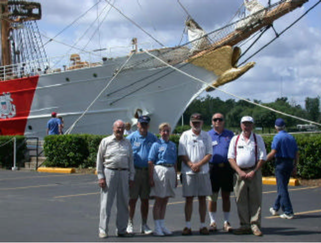
Above: posed in front of the Eagle, L—R: KA3YTS, N3HOW, N3HOZ, KG4SZG, W2PTZ, KE4HZ

These pictures of the event are courtesy of and ©Copyright 2003 Don Stark N3HOW.