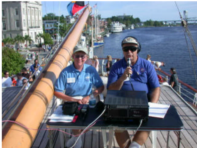
Below: N3HOZ & W2PTZ operating from aboard the Eagle