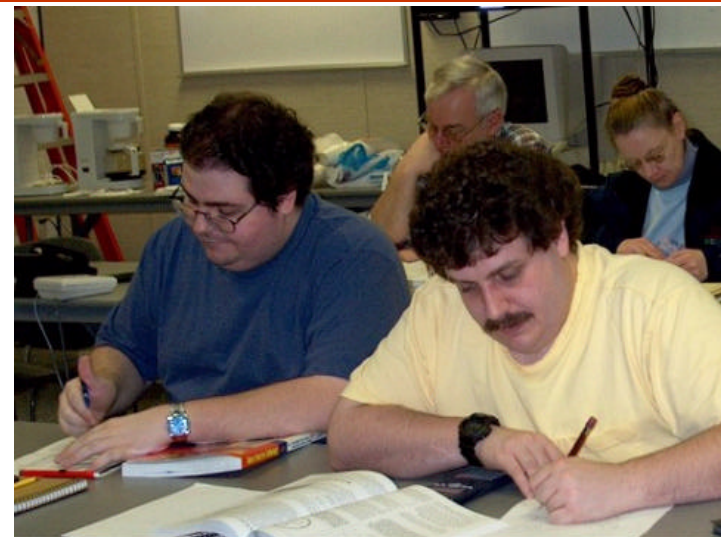
KB3JHL & KB3JHM