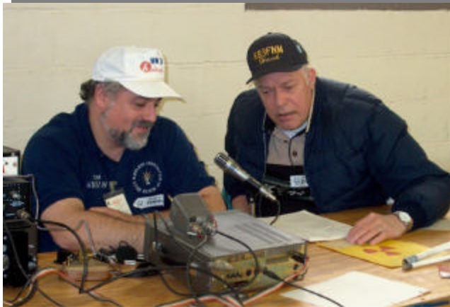
KB3FNM assisting as WN3VAW was working DX & stations in the CA QSO Party from Ron's hamfest table. Unfortunately, propagation was not favorable to working the NP2SH Dxpediton that day as well