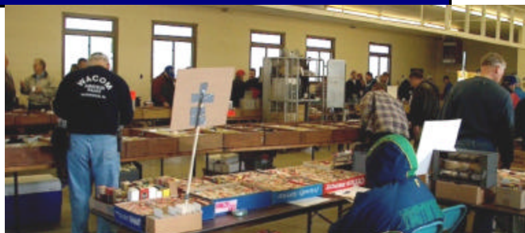
Above: The early morning crowd had lots to look over!