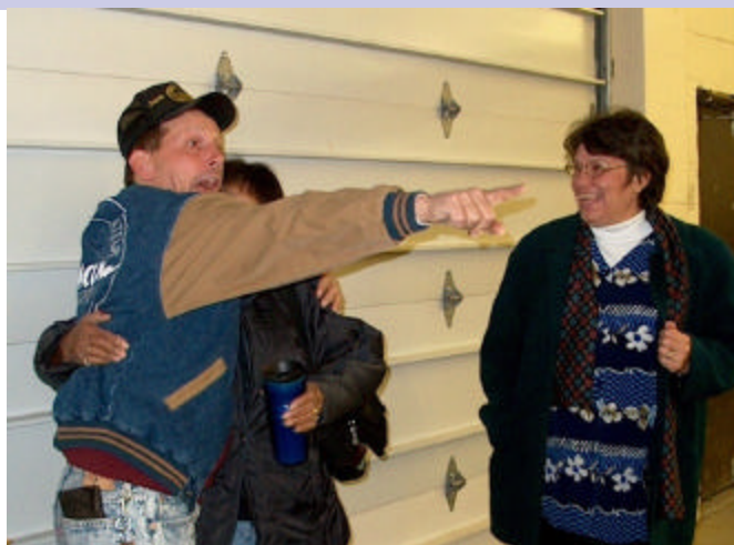
Hamfest chairman directs vendors to a table