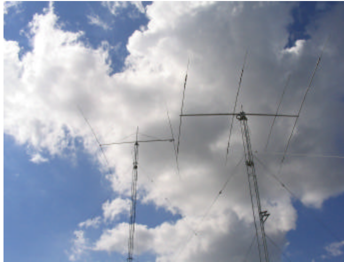
Above: Part of the W8EDU Antenna Farm