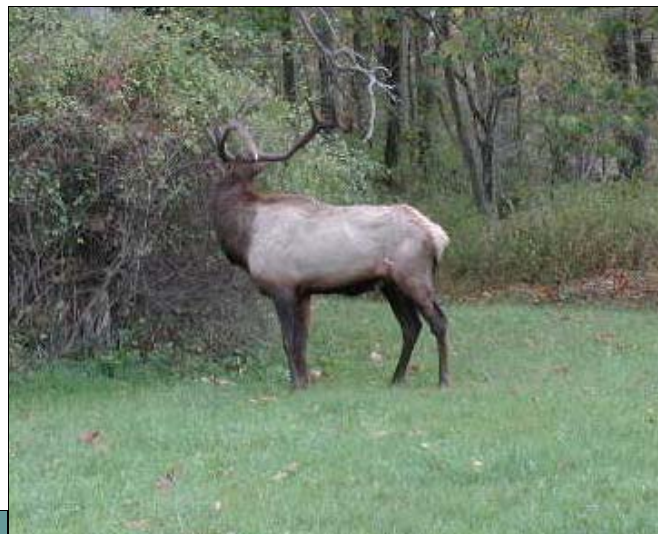
This Elk was in Cameron County - Not in Elk County like one would expect.